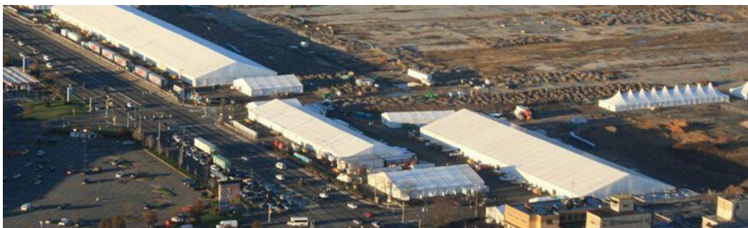
Monmouth, New Jersey ICP - Sandy Response