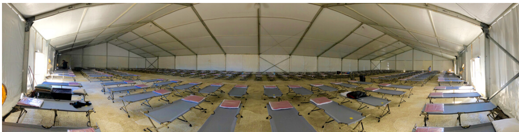
Billeting Tent Post Hurricane Michael - Port St. Joe, FL

We are proud of the relationships we have developed with our Government Emergency Managers, Contracting officers, friends in the private sector, Environmental Response, Petroleum Industry, Healthcare, Energy and Utilities Teams. We take these relationships very seriously and will move beyond the call of duty to make sure the task is accomplished with pride and perfection