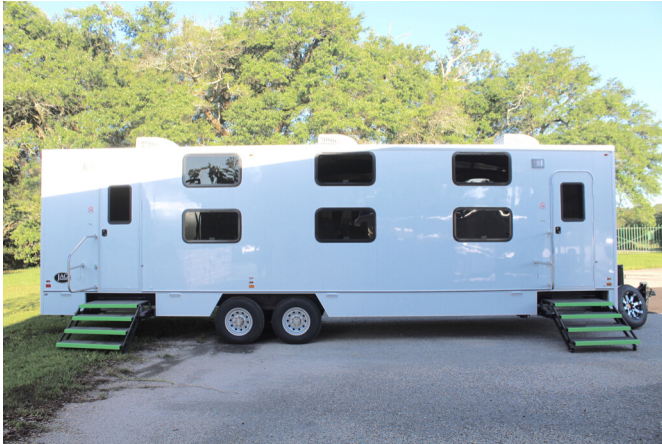
14 Bed Mobile Sleeping Unit