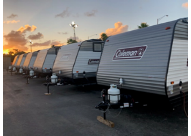
4 Bed Quarantine Units

Granny's Mobile Sleeping Units feature 4 to 42 beds, bedding kits and optional wrap around services. Our completely self-sufficient units are instrumental for wildfire crews, remote man-camps, evacuations and COVID quarantine social distancing.