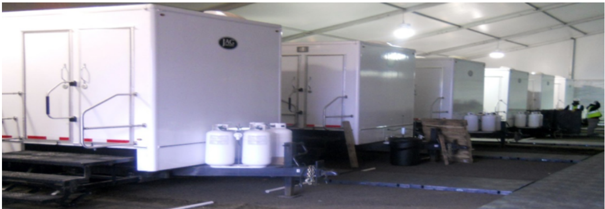
4000 Person Camp - MOBILE SHOWERS UNDER COVER -