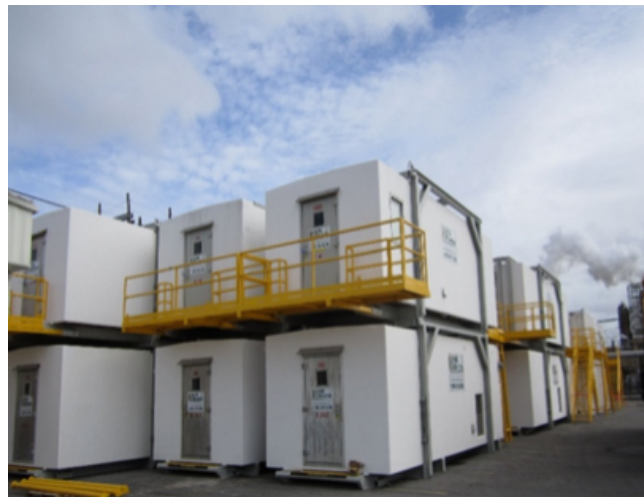
350 PERSON MODULAR BASE CAMP

GRANNY'S ALLIANCE HOLDINGS, INC. has multiple years of experience supplying equipment and emergency response services to the petroleum industry. From the Deepwater Horizon incident to providing strike shutdown base camps during the United Steelworkers (USW) strikes to other turnaround services, our company has an excellent performance history.