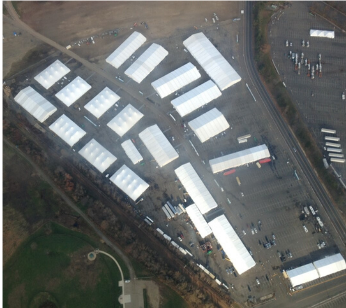
4000 Person Camp - Hurricane Sandy Monmouth, NJ