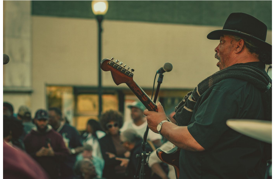
I can't describe what you don't see in Mixed Company.