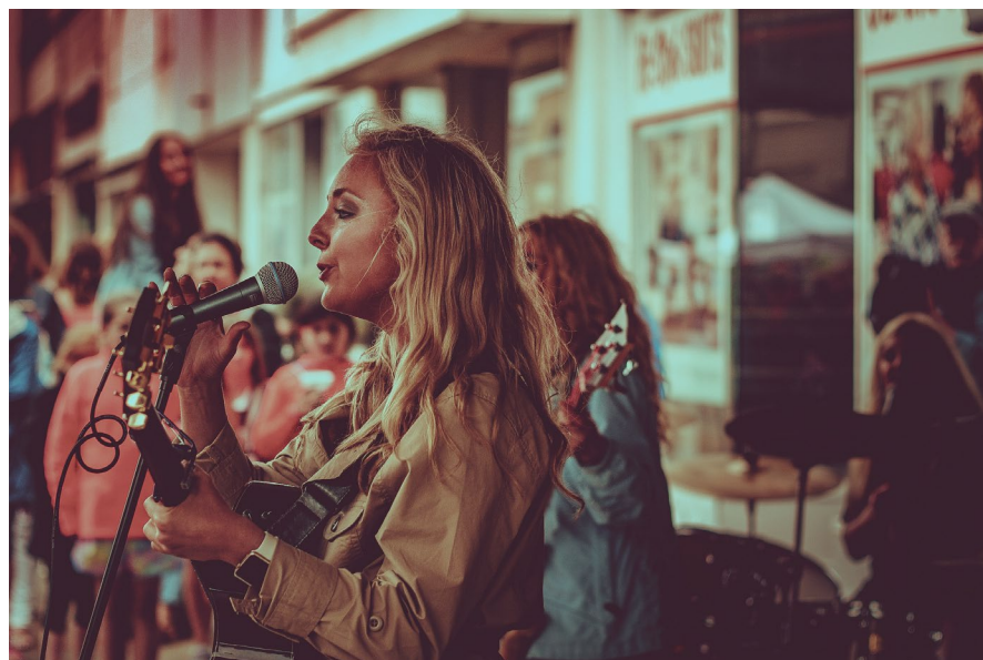
Southern Halo at Juke Joint Festival in Clarksdale, MS