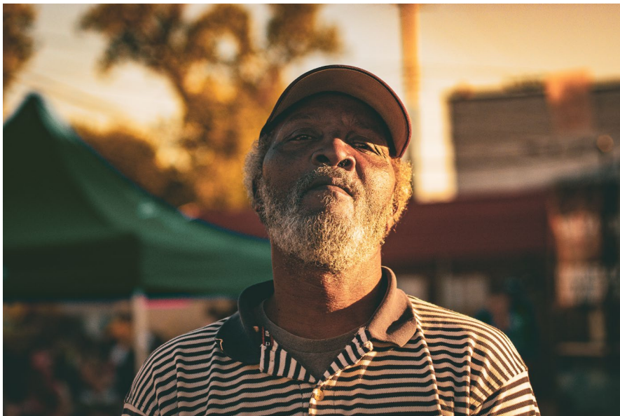
He drank, danced, insisted I take his picture, and refused to smile.