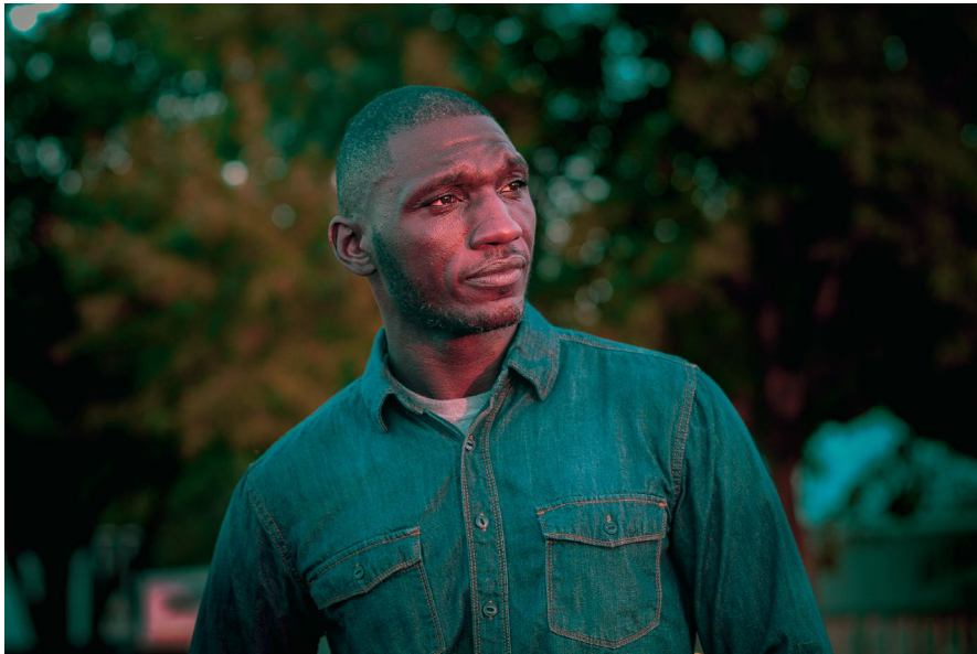
Cedric Burnside in Greenville, MS