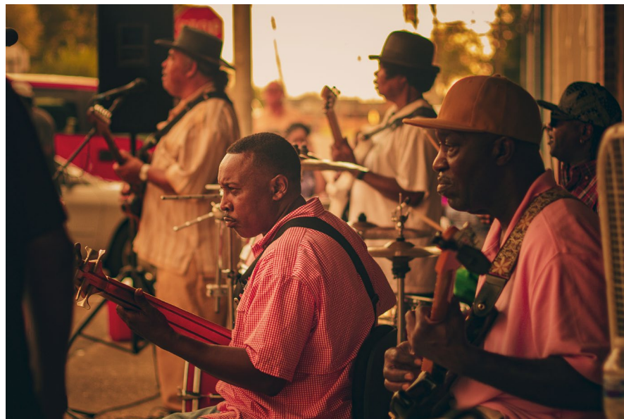
First Friday Blues at Hollandale, MS