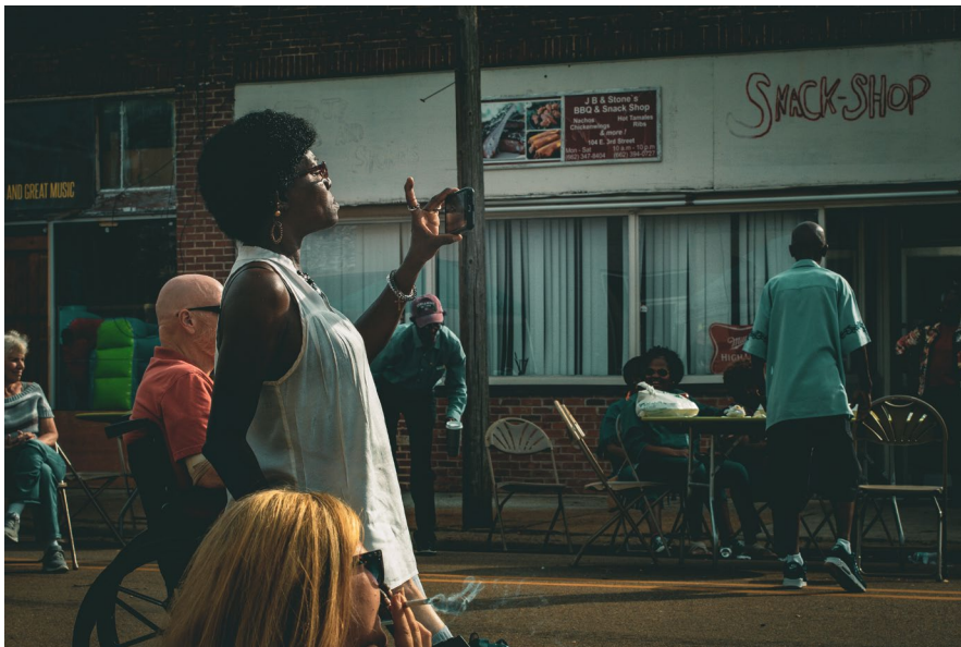
Leland, MS Crawfish Festival 2018