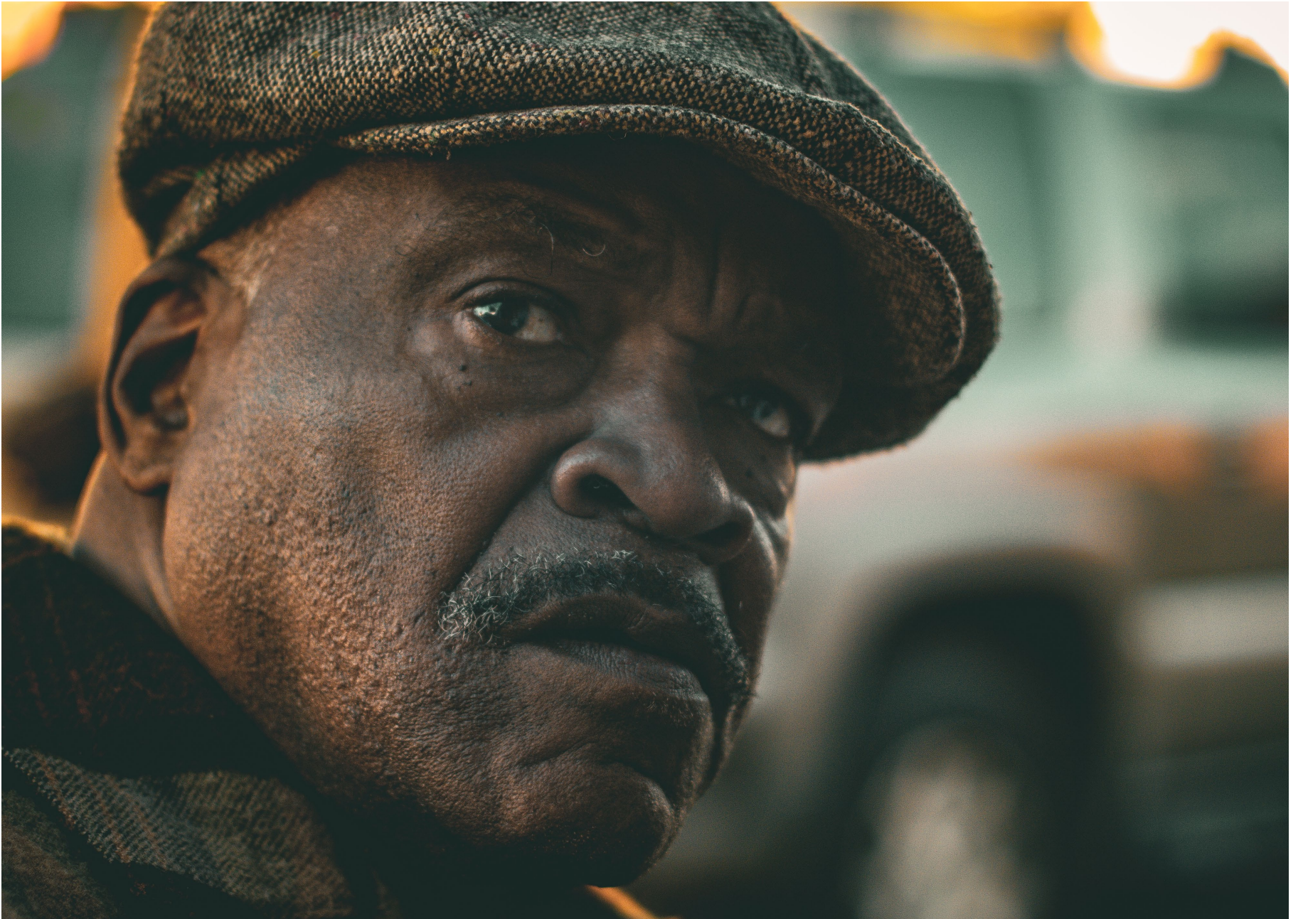
He is a Retired School Teacher and we ate pork skins together.