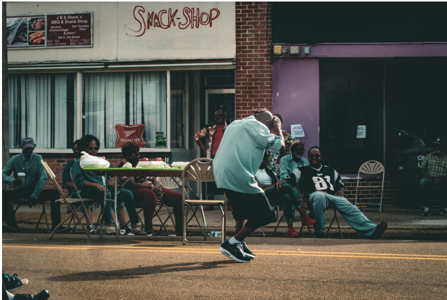
The stage isn't the only show in Leland, MS