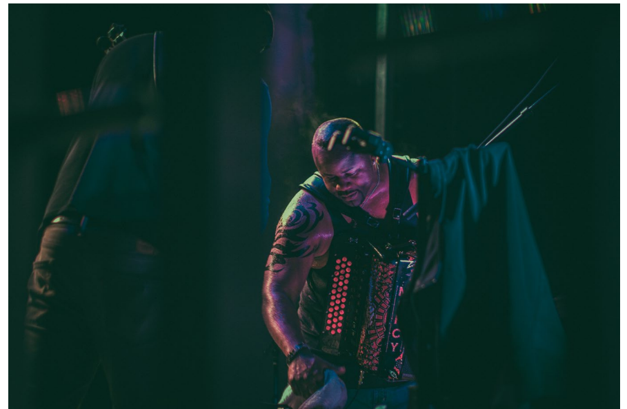
Dwayne Dopsie at Mighty Mississippi Music Festival