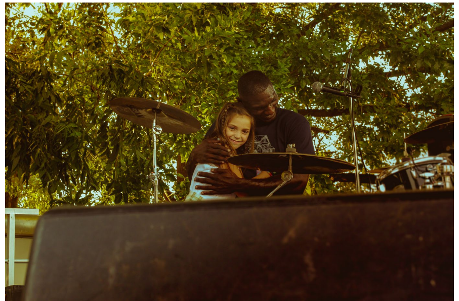
Cedric Burnside and dancing little girl.