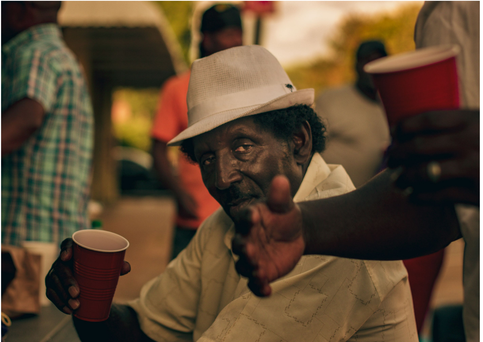
Sugarman is Nice Folks. They fed me a plate of BBQ Shrimp & Pork.