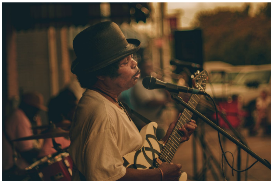
Mickey Rogers, funky bluesman. Performing "Are You Serious"