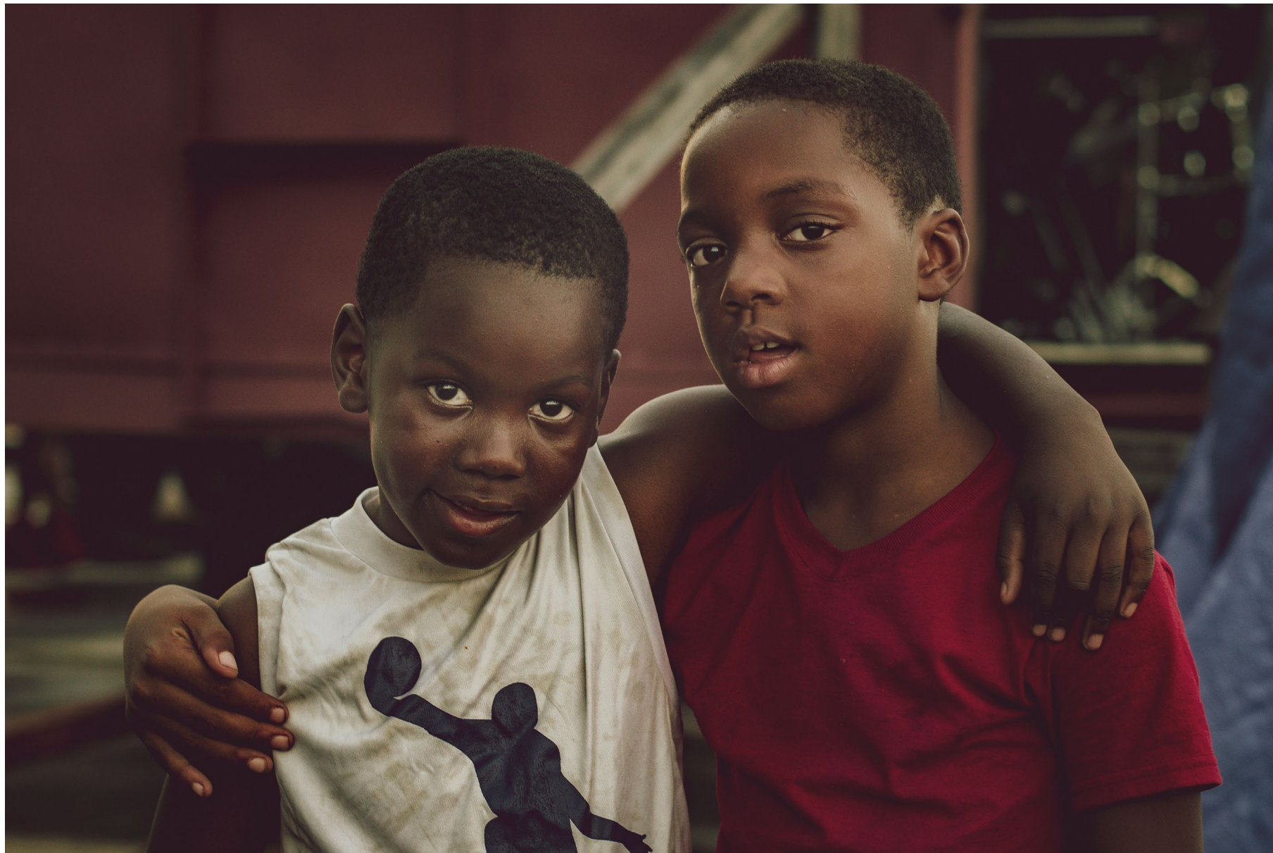
Cool Kids at Sam Chatmon Music Festival