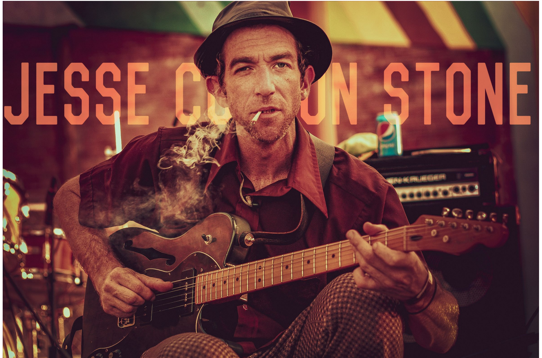
Hand Rolled Tobacco